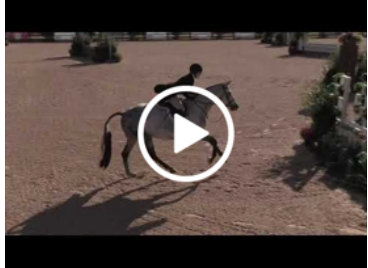
Sophia Vella and Just For Kicks in their winning round